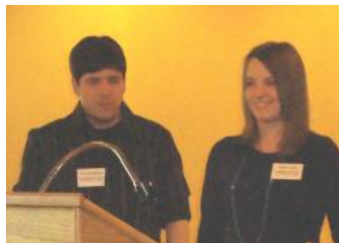
Two of our CAD Winners